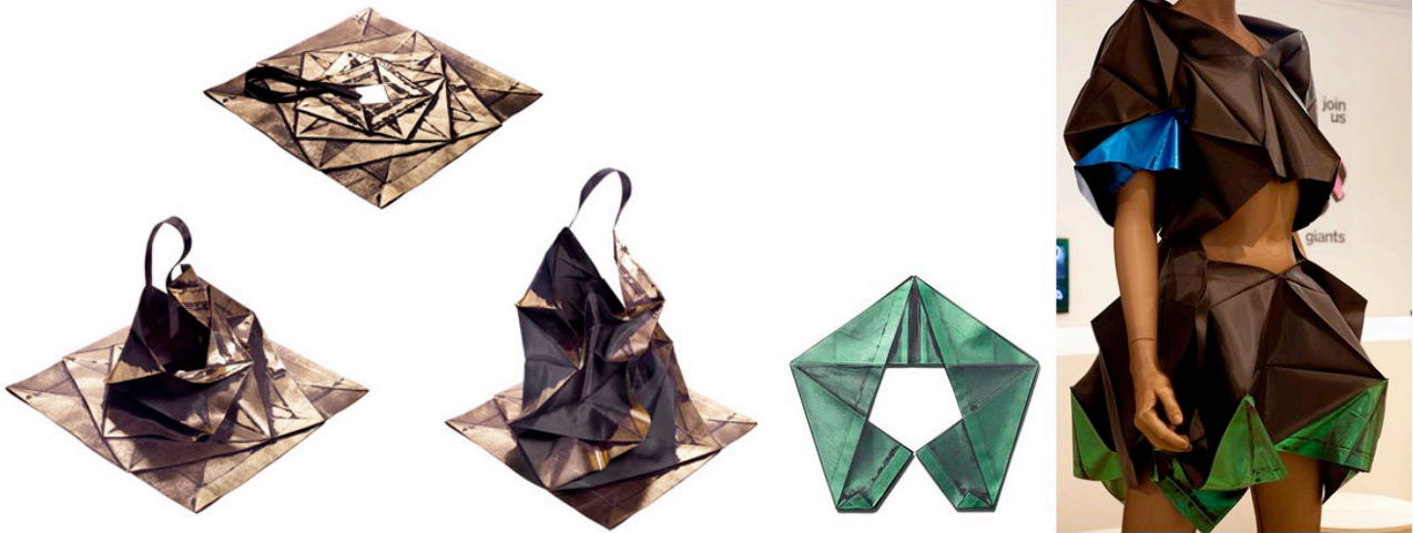
Figure 3: Objects of the Collection 132 5. Issey Miyake.

In any case, a recurring theme in the award nominations of 2012 was the issue of innovative and accessible design (Museum 2011) and the award for fashion went to the Issey Miyake Collection 132 5 (Issey Miyake Design Studio Tokyo, Japan, 2012). In this collection the accent is on the concept, the process that led to the final effect of the product.