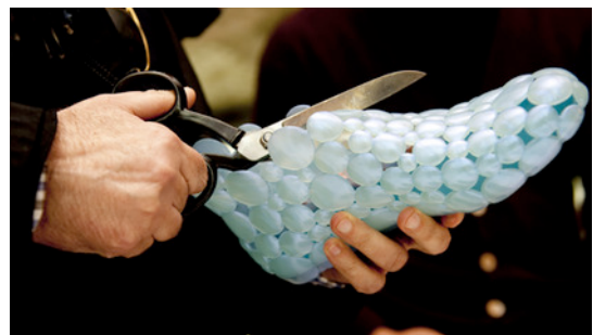
Figure 4: Brompton Coat.