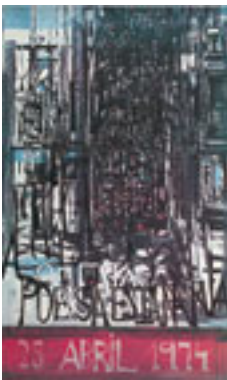
Fig. 11. Vieira da Silva. 1974 . "25th April". (75 cm X 124 cm). Poster printed in offset by Neogravura. BNP.