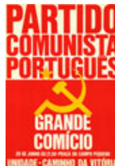
Fig. 14. Anonymous. 1974 . "Portuguese Communist Party". (48 cm X 68 cm). Poster printed in offset. CML/UA.