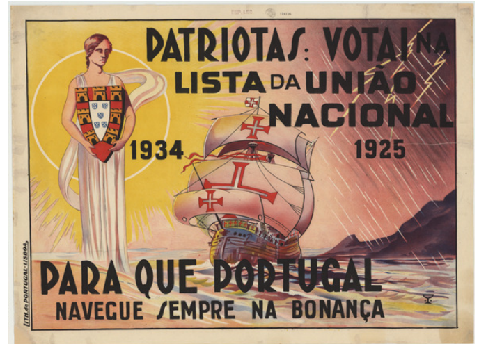
Fig. 2. Anonymous. 1934. “Patriots, Vote”. (99. cm X 74.2 cm). Poster printed with lithography at the Lith. de Portugal using four colours. BNP.