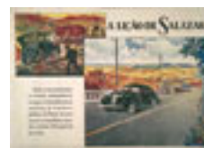
Fig. 8. Martins Barata. 1938 . "Salazar's lesson". (111.5 cm X 77.8 cm). Poster printed with lithography at the Lith. de Portugal using six colours. BNP.