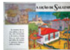
Fig. 7. Emmerico Nunes. 1938 . "Salazar's lesson". (111.5 cm X 78 cm). Poster printed with lithography at Bertrand (Irmãos) Ltd, using seven colours. BNP.

Lesson" 6 offers one of the best examples of how the Estado Novo depicted the significant change that was deemed to have occurred, not only in industry, with the idea of progress, but also in the quality of Portuguese social and cultural life with the welfare state. This was a State that claimed to defend the interests of the Portuguese people, or rather, to 'take care' of them in a protectionist manner (Fig. 7 to 9).