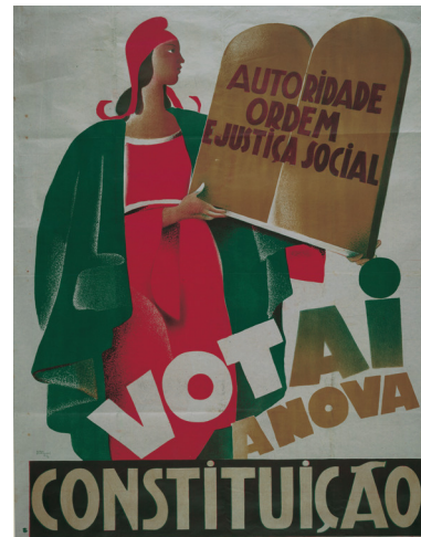
Fig. 3. Jorge Barradas. 1933. “Vote for the New Constitution”. (89.8 cm X 116 cm). Poster printed with lithography at the Lith. de Portugal using three colours. BNP.