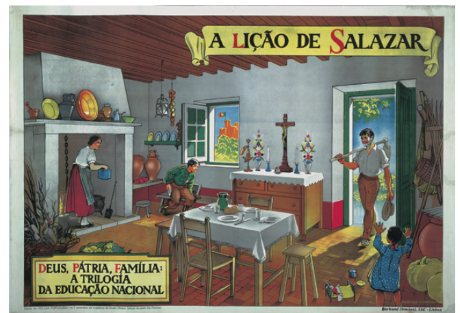
Fig. 5. Martins Barata. 1938. “Salazar’s lesson”. (111.5 cm X 78 cm). Poster printed with lithography at Bertrand (Irmãos) Ltd, using seven colours.