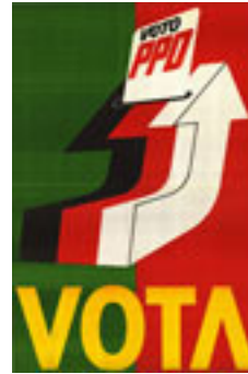
Fig. 16. Anonymous. 1976 . “Vote PPD”. (58.1 cm X 87.1 cm). Poster printed in offset by Mirandela & C.ª. CML/UA.

Curiously, the posters of parties located more to the right of the political spectrum tended to favour less iconic images. For example, the poster of the Popular Democratic Party bore an arrow (Fig. 16) while the Social and Democratic Centre had two arrows and a circle inscribed within a square, representing the symbol of the party (Fig. 17). These are interesting examples of visual communication, which go beyond the tendency for abstractionism. While the PPD used the colours of the national flag, the CDS (perhaps to attract more supporters) chose a version that was less clearly defined in terms of ‘political colour’, representing that pluralism through a rainbow. However, the fact that both parties used black in their posters would seem to indicate a degree of modernity in the visual discourse of the right (during the Estado Novo, that colour was more frequently used by left-wing parties).