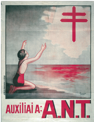
Fig. 6. Graça. 1934. "A.N.T.". (89.9 cm X 120.2 cm). Poster printed with lithography at the Lith. de Portugal using two colours. BNP.

arms heavenward, in an attitude of humility, veneration and supplication.