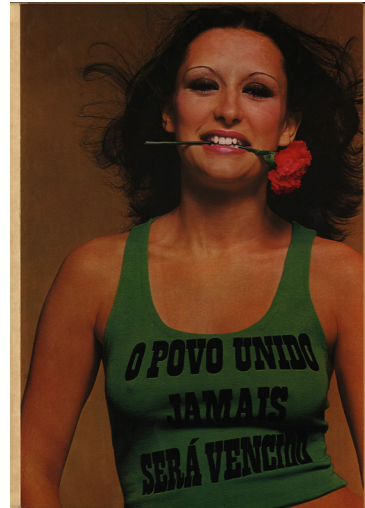
Fig. 21. Anonymous. 1974 . “The people united will never be overcome”. (48 cm X 70 cm). Poster printed in offset. BNP.