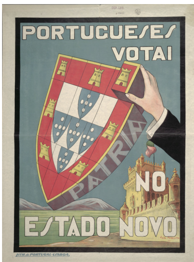
Fig. 1. João Ferreira. 1934. “Portuguese citizens, Vote!”. (74.4 cm X 99.5 cm). Poster printed with lithography at the Lith. de Portugal using four colours. BNP.

The ideology of fatherland and nation was powerfully evoked through motifs taken from the national flag, whose design dated from around the time of King Manuel I (1495-1521); this consisted of blue escutcheons with bezants and gold castles on a red background, which are also included in the present flag) (Figs. 1 and 2). In that period of King Manuel, another flag was also used with a green background and the Cross of Christ in the centre (a symbol much used on Portuguese ships during the era of the Discoveries), and this too began to appear on posters of the Estado Novo, thereby glorifying one of the most important periods of Portuguese history (Fig. 2). The image of the female figure known as “The Republic” (created in 1910 with the overthrow of the constitutional monarchy that gave rise to the Republican regime) was also used to reinforce the sense of patriotism and emphasise the nationalist ideal (Fig. 2 and 3).