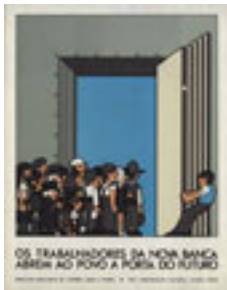
Fig. 19. João Abel Manta. [1975]. “The workers at the new bank open the door of the future to the people”. (47 cm X 60 cm). Poster printed in offset. BNP.