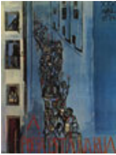
Fig. 10. Vieira da Silva. 1974 . "Poetry is in the street". (80 cm X 105 cm). Poster printed in offset by Neogravura. BNP.