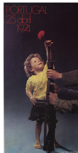
Fig. 22. Sérgio Guimarães. 1974 . “Portugal 25th April 1974”. (78 cm X 116 cm). Poster printed in offset by Lisgráfica. BNP.

The posters depicted in Figures 21 and 22 stand out for two reasons. The first shows one of the most emblematic messages of the revolution “The people united will never be overcome”. The female figure is dressed in modern clothing and her apparent spontaneity suggests a greater degree of freedom than was evident in the sombre, static, pseudo-tranquil posters of the