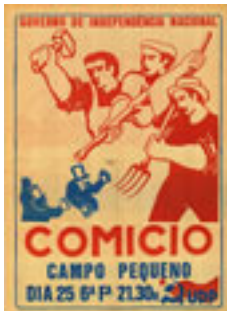
Fig. 20. Vieira da Silva. 1974 . “25th April”. (75 cm X 124 cm). Poster printed in offset by Neogravura. BNP.