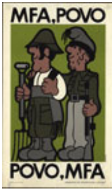
Fig. 18. João Abel Manta. [1975] . “MFA, people, people, MFA”. (42 cm X 72 cm). Poster printed in offset. BNP.