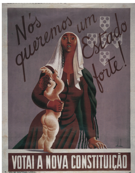
Fig. 4. Almada Negreiros. 1933. “Vote for the New Constitution”. (90 cm X 116 cm). Poster printed with lithography at the Lith. de Portugal using three colours. BNP.

Fatherland, Family –” 5 . An illustration of this can be found in a poster by Almada Negreiros (1893-1970) (Fig. 4) in which a female figure with her head covered holds a naked child, evoking the idea of the Virgin Mary with the baby Jesus, and therefore appealing to the people’s religious and maternal sentiments. This image seems to subliminally translate the basic concept of the Estado Novo (“God, Fatherland, Family”), while at the same time reinforcing nationalist iconography with the use of the escutcheons from the Portuguese flag, arranged in a discrete design suggestive of a cross. As for the text, which reads “We want a strong State”, conceptually reflects part of Point 2 of the Decalogue – “Today, all can see how our circumstances have changed. Portugal is a Strong State” (SPN, 1930-).