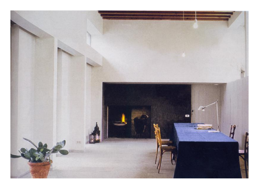
Fig. 9. View on the living room

As appears from the description of the Van Hee house, the architect tries to find a balance between contemporary architecture, archetypes and her own vision on dwelling.