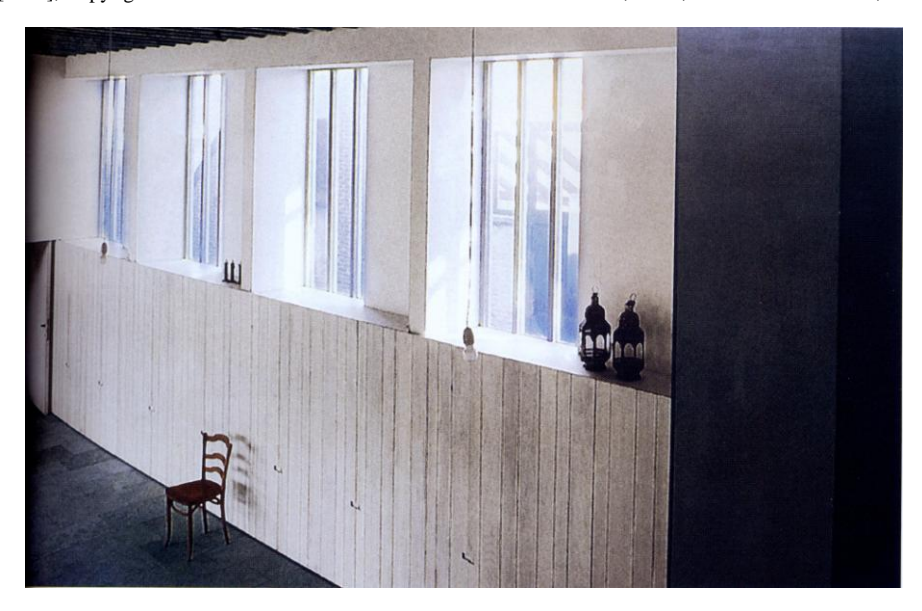
Fig. 7. Storage Space