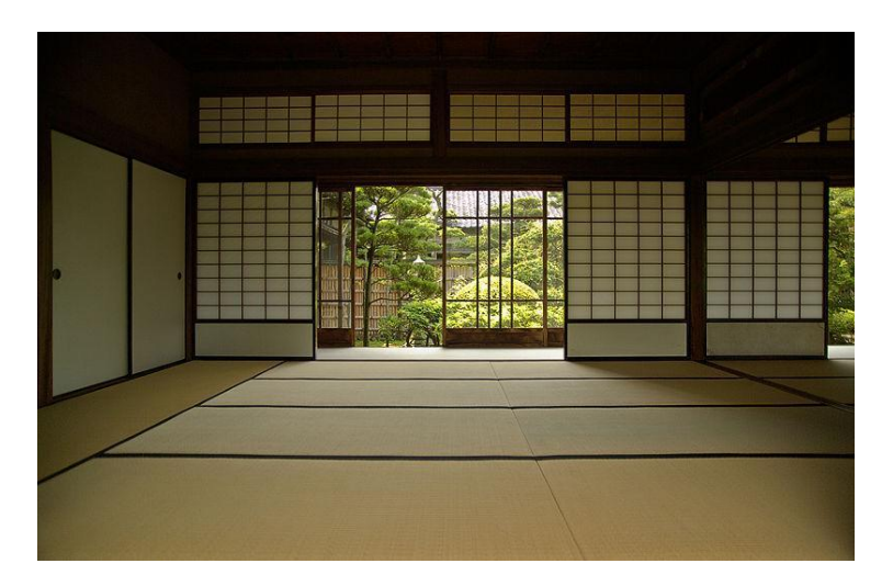
Fig. 1. Traditional Japanese Interior

class elite lived in these kind of dwellings where they practiced the aesthetics of simplicity and social harmony inspired by Zen Buddhism" [6]. The majority of the population in the past didn't have that choice and couldn't afford more than a modest dwelling. In her ethnographic research of the contemporary Japanese home culture, Daniels encounters less austere dwellings and more dwellings with a cluttered, decorated interior, which she sees more as the norm than the exception.