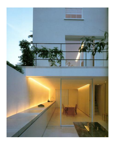
Fig. 3. John Pawson's Home

place the kitchen and dining room in the lower ground, which gives entrance to the individual garden. This garden is rather a patio that doesn't reveal much of itself to the neighbors or the public in general.